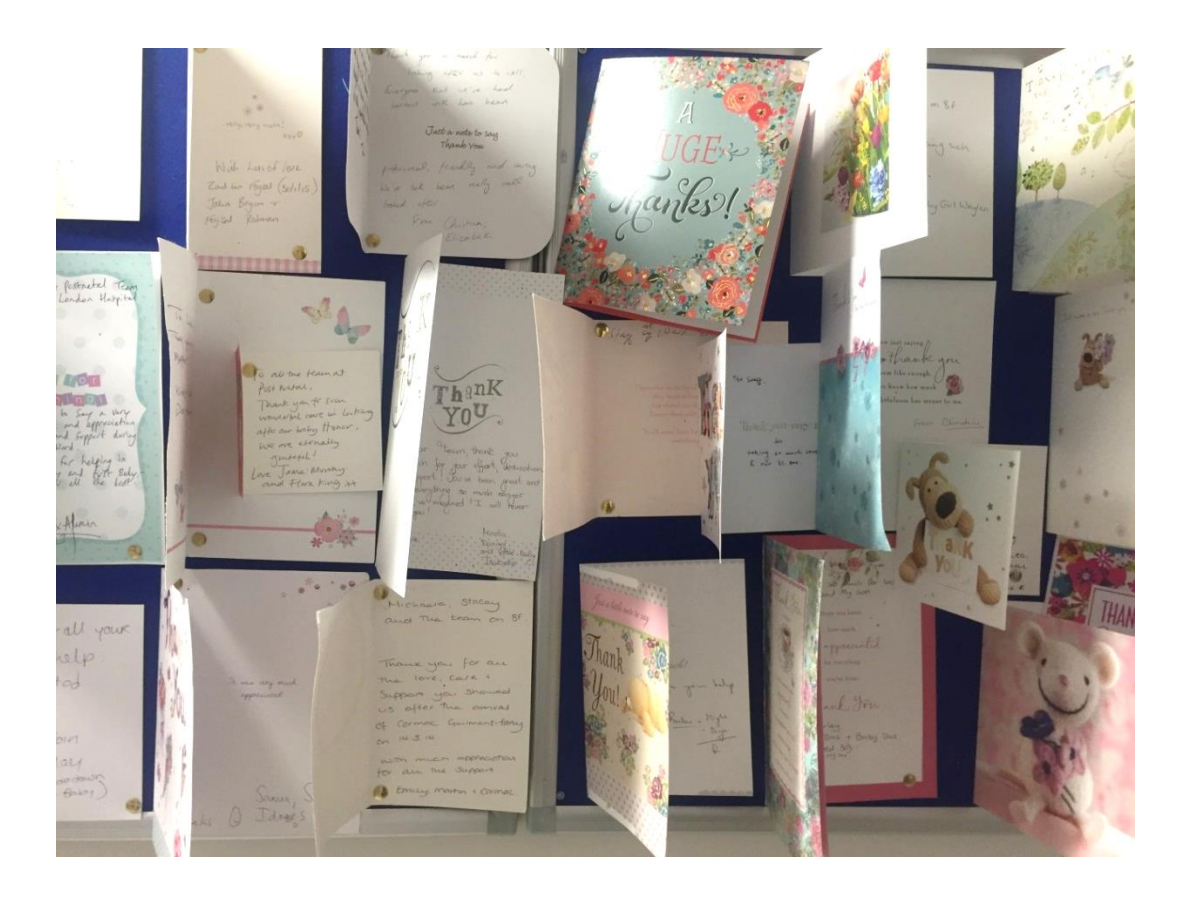
Figure iii) Notice board at RLH

3.3 The review evidence also included several detailed accounts from mothers who had had difficult births or who had babies who were born seriously unwell and praise for the emergency care teams was widespread. Some women who had previously given birth at the RLH noted improvements since their earlier time there.